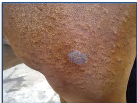
Typical papular and scaling and crusting dermatophytosis lesions

HAIR PLUCKS are indicated whenever there is hair loss, broken hairs, crusts, scales or altered growth patterns particularly if dermatophytosis (or dermatophilosis) is suspected. It is best performed with rubber-covered artery forceps and this is a far better sample for fungal culture and microscopy than scrapes . Dermatophyte growth is best obtained from hair plucks following alcohol spraying the skin to reduce contaminants. Microscopic examination for dermatophytosis based on plucks from the margins of the lesions offer the highest diagnostic rate. Direct microscopic identification of dermatophytes can be difficult and negative findings during direct microscopy does not rule out dermatophytosis. Definitive findings in dermatophyte infections are hyphae and arthrospores in the hair shaft but these are seen only in 50-60% of cases at most. All suspected dermatophyte samples should be further cultured to help confirmation and identification of the species (see below).