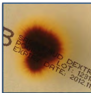
Dark red-brown reverse pigmentation of Trichophyton equinum growing on Sabourauds agar